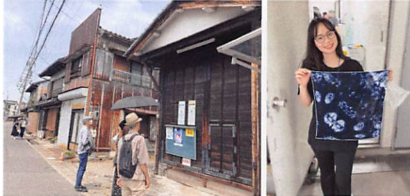
In front of the float warehouse in Narumi