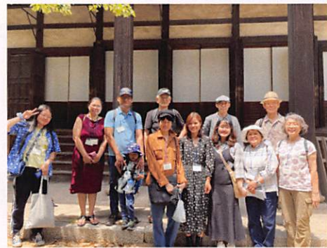
at the Manganji Temple in Narumi town author second from the right in the back row